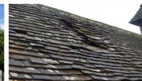
St Peter, Whitfield roof repairs