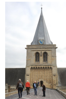
Members' visit to the roof of Rochester Cathedral

Many of our members take part in this annual cycling and walking event in September to raise money for their own church and for FKC to enable the Friends to give grants to churches.